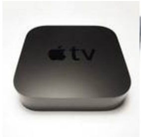
Apple TV [HDMI CableB]