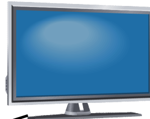
TV Display HDMI 3