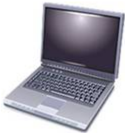
Laptop [HDMI Cable B]